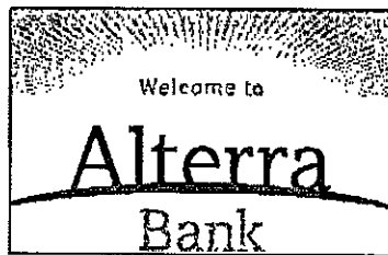
18" x 10" Door Decals